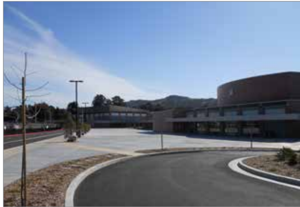
DeAnza High School

Children’s Foundation and offers preschool and elementary school serving a total of 80 students.