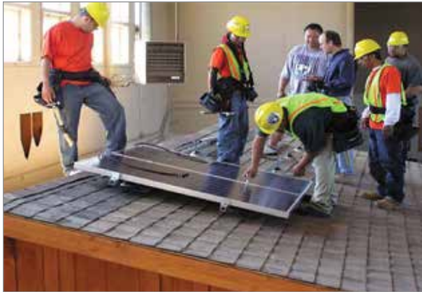
Workforce training programs such as RichmondBUILD prepare Richmond residents for emerging industries.