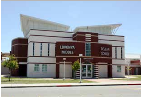
Lovonya DeJean Middle School