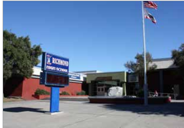
Richmond High School