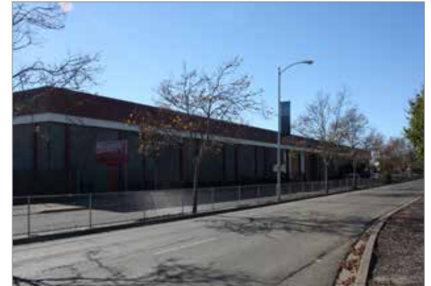
Kennedy High School