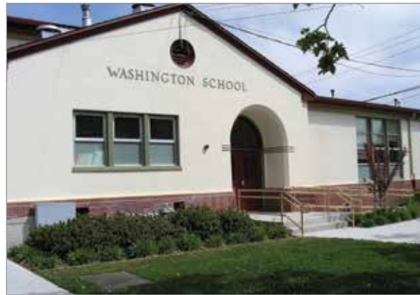
The City will partner with public agencies including the West Contra Costa Unified School District expand programs and services to meet growing demand.

The demand for human services is growing. The City will strengthen its coordination with County, state and nonprofit providers to improve delivery and effectiveness of services across the community. Improved transportation connections and expanded mobile programs and services can help connect people to educational and human services.