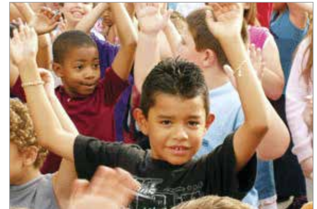
Education and human services programs have to meet the needs of a diverse community.

Richmond is committed to supporting expansion of its education and human services resources to address community needs. Although it is not a state-