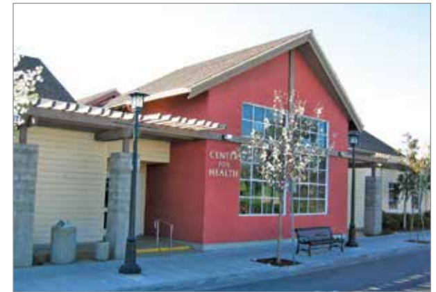
Neighborhood-based facilities can deliver high-quality services to residents close to where they live.

Public education faces significant challenges in managing demographic changes, budget shortfalls, shifting curricular priorities and facilities maintenance. Demand for vocational education and English language acquisition programs are on the rise, while declining district enrollment has resulted in some school closures. Additional resources are needed to meet residents’ needs for preschool and childcare especially for infants. Richmond will enhance the education system by: