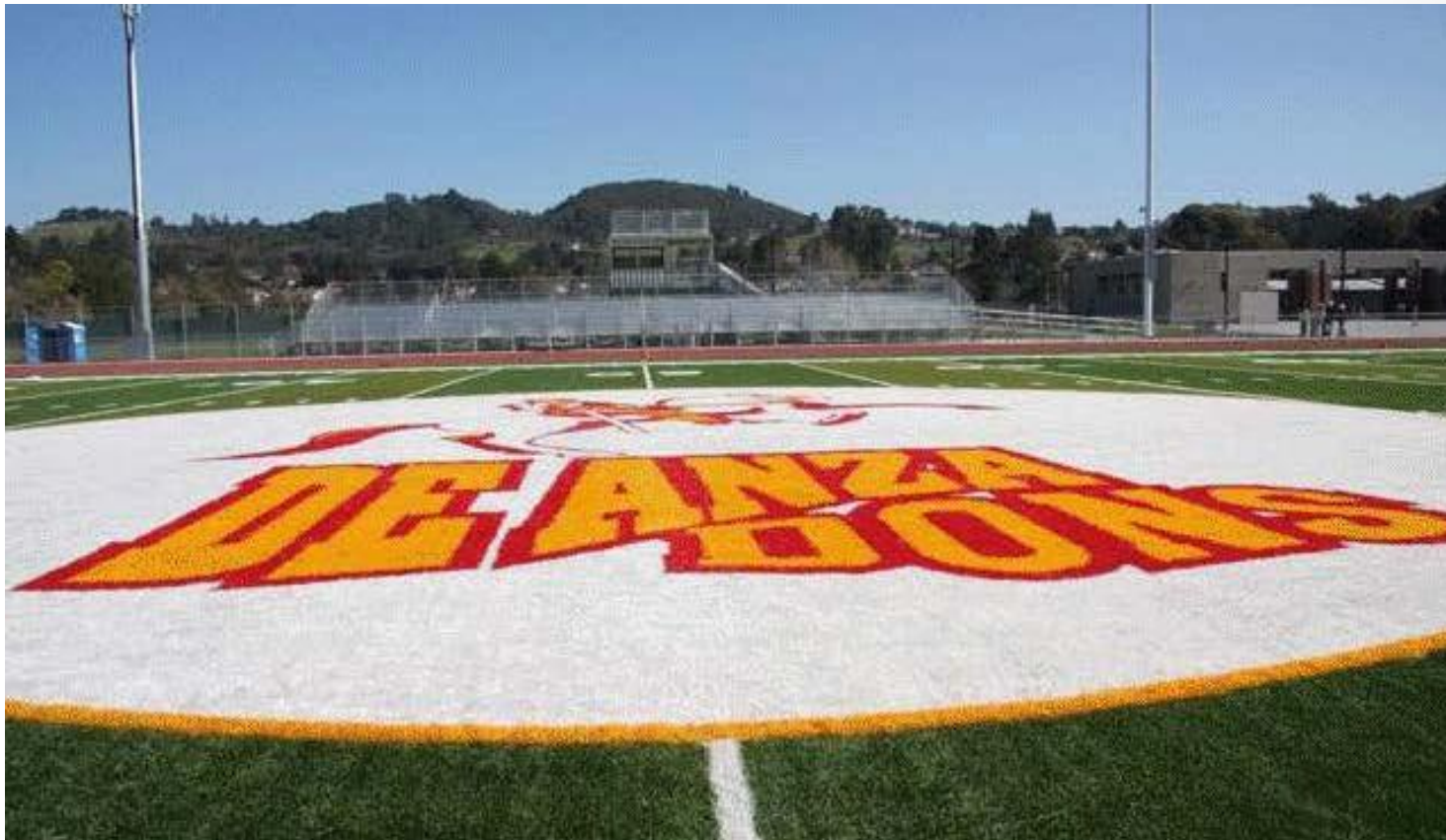
Richmond Health Equity Partnership (RHEP) Meeting #16 (month 19 of 24) DeAnza High School 5000 Valley View Rd. Richmond, 94803