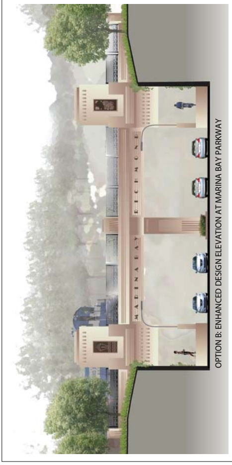
OPTION B: ENHANCED DESIGN ELEVATION AT MARINA BAY PARKWAY

For further information or questions, please contact Richmond Community Redevelopment Agency Staff at 510.307.8140, or visit: http://www.ci.richmond.ca.us/index.aspx?NID=951 .