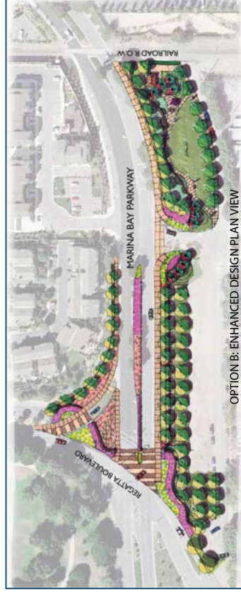
OPTION B: ENHANCED DESIGN PLAN VIEW

Option B includes the addition of usable open space, expanded landscaping limits, and enhanced aesthetic upgrades on Marina Bay Parkway from Regatta Boulevard to Meeker Avenue. Construction duration will be 20 months with the closure of Marina Bay Parkway from Jetty Drive to Meeker Avenue until the completion of construction. This option is fully funded through construction. The shortened construction duration will provide cost savings that will be allocated to the addition of usable open space, expanded landscaping limits, and enhanced aesthetic upgrades.