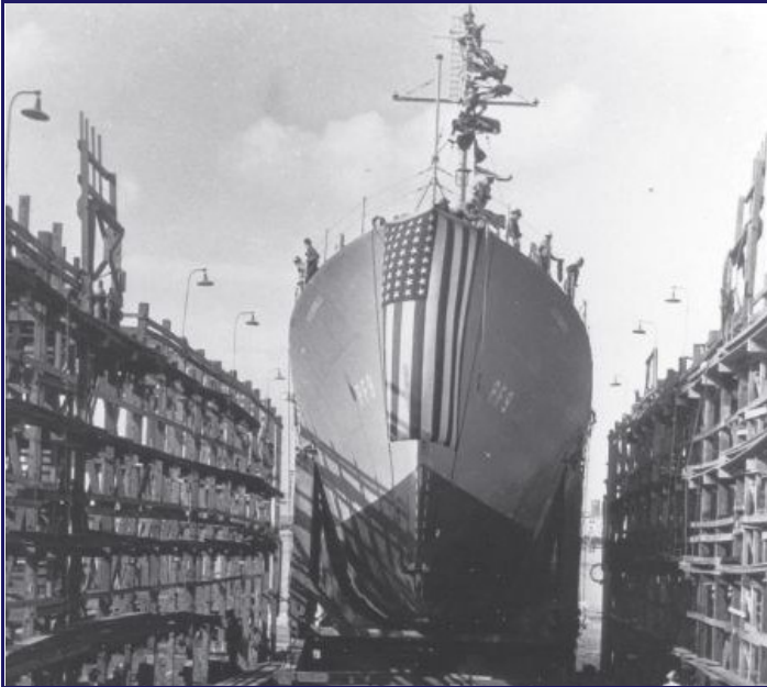
USS Pocatello Launch, October 17, 1943

The City of Richmond is located 16 miles northeast of San Francisco on the western shore of Contra Costa County. Richmond was incorporated on August 7, 1905 and became a charter city on March 24, 1909.